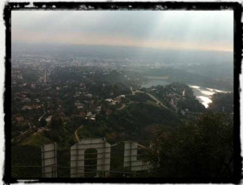
Griffith Park - Hollywood Sign Hike