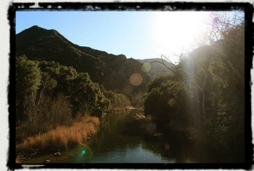
Malibu Creek - Malibu