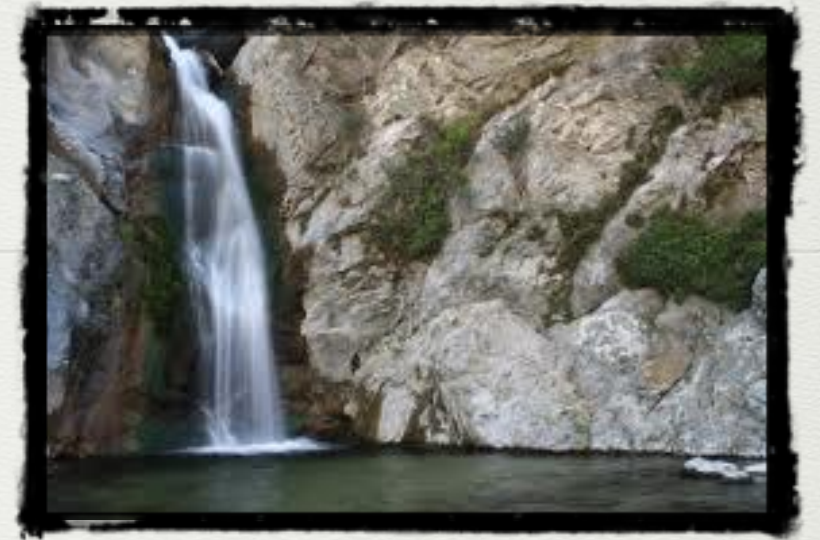
Sturtevant Falls, Pasadena